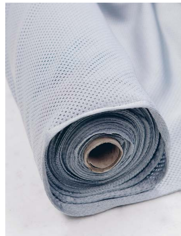
HÅG SoFi with mesh back in production at Røros factory in Norway