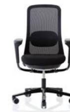
HÅG SoFi 7500 with black mesh (MEH001) back*