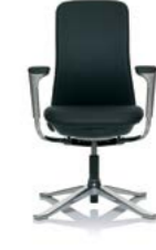
HÅG SoFi 7302 Polished Exclusive*