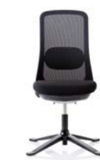
HÅG SoFi 7502 with black mesh (MEH001) back