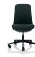
HÅG SoFi 7202 with fully upholstered back