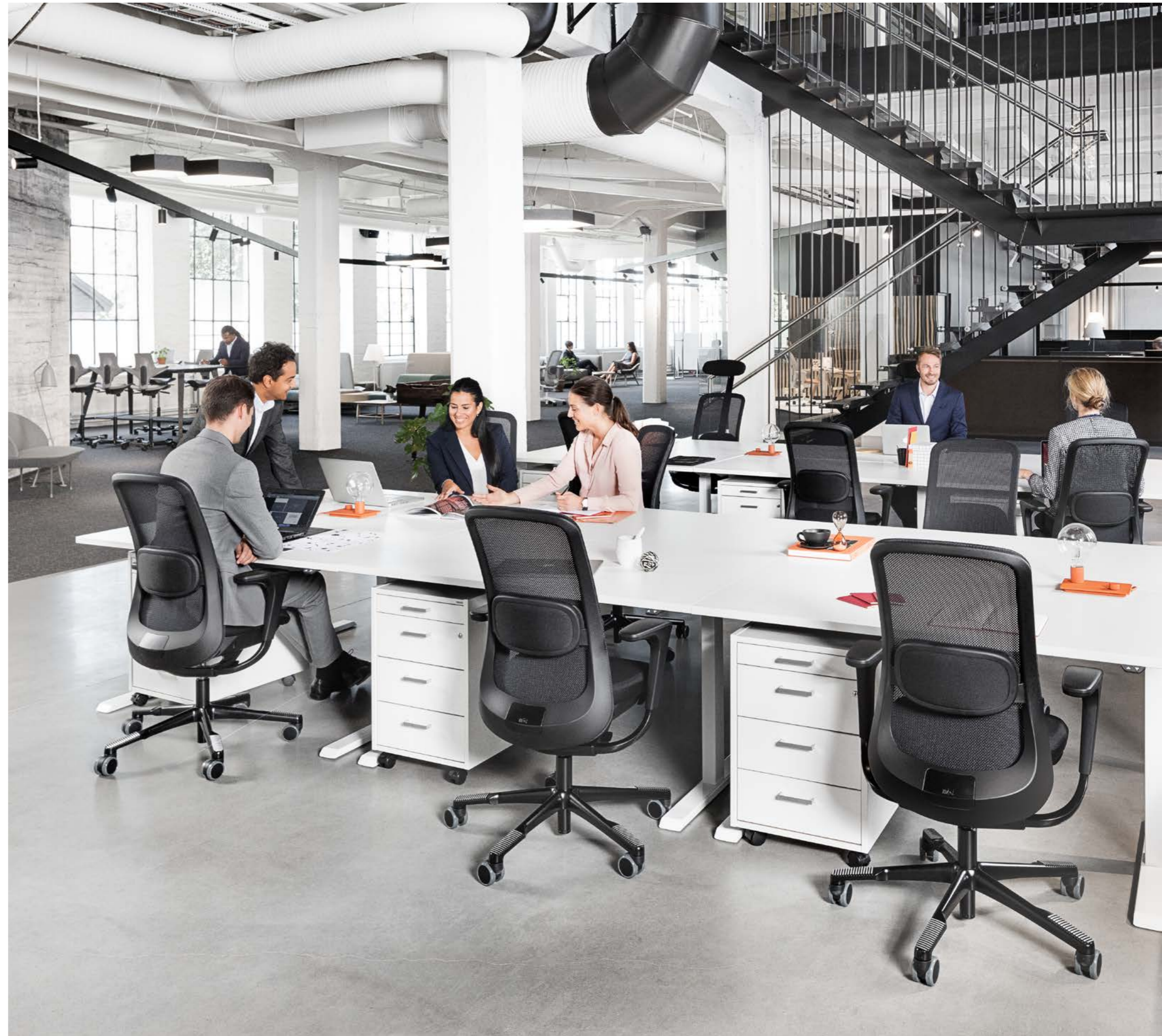
HÅG SoFi 7500 with black mesh back (MEH001). Textile: Note 60999 from Gabriel.

So HÅG's aim has remained simple and consistent: bring active sitting to a modern world that has forgotten the importance of movement.