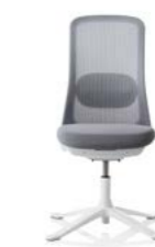
HÅG SoFi 7502 with grey mesh (MEH002) back