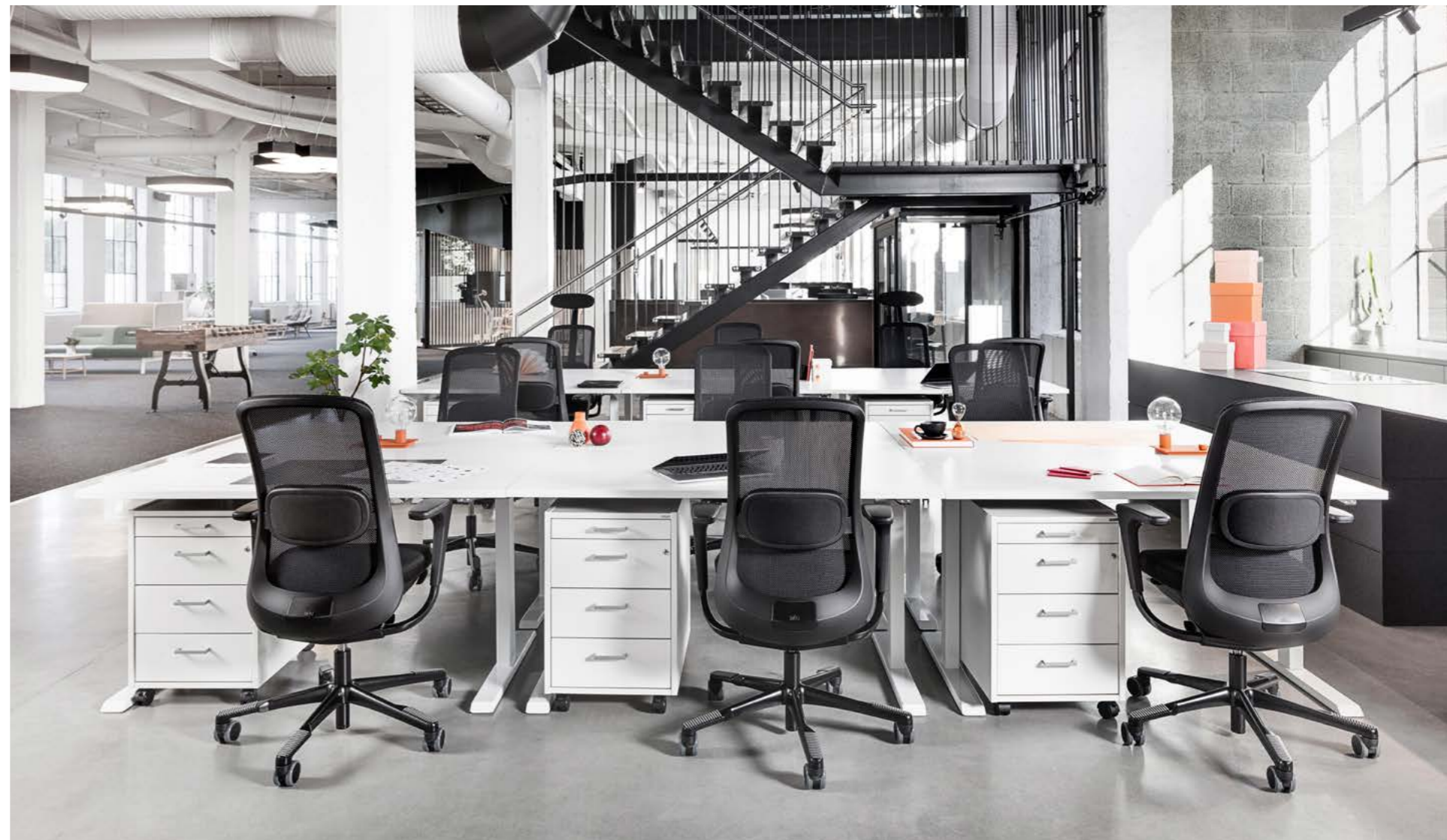
HÅG SoFi 7500 with black mesh (MEH001) back. Textile: Note 60999 from Gabriel.