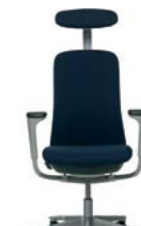
HÅG SoFi 7300 with fully upholstered back and headrest*/**