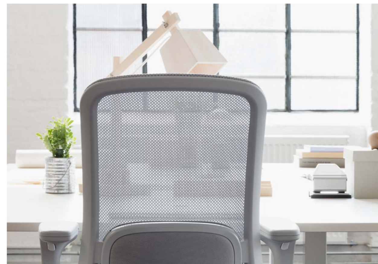
HÅG SoFi mesh 7500 with light grey mesh back (MEH002). Textile: Nexus Pewter 01 from Camira.