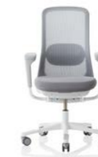
HÅG SoFi 7500 with light grey mesh (MEH002) back*