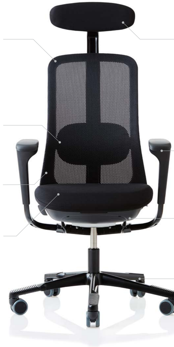
HÅG SoFi 7500 with mesh back ↑

Provides comfortable ways to rest, move and vary the position of your feet.