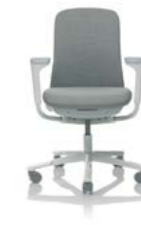
HÅG SoFi 7200 with fully upholstered back*