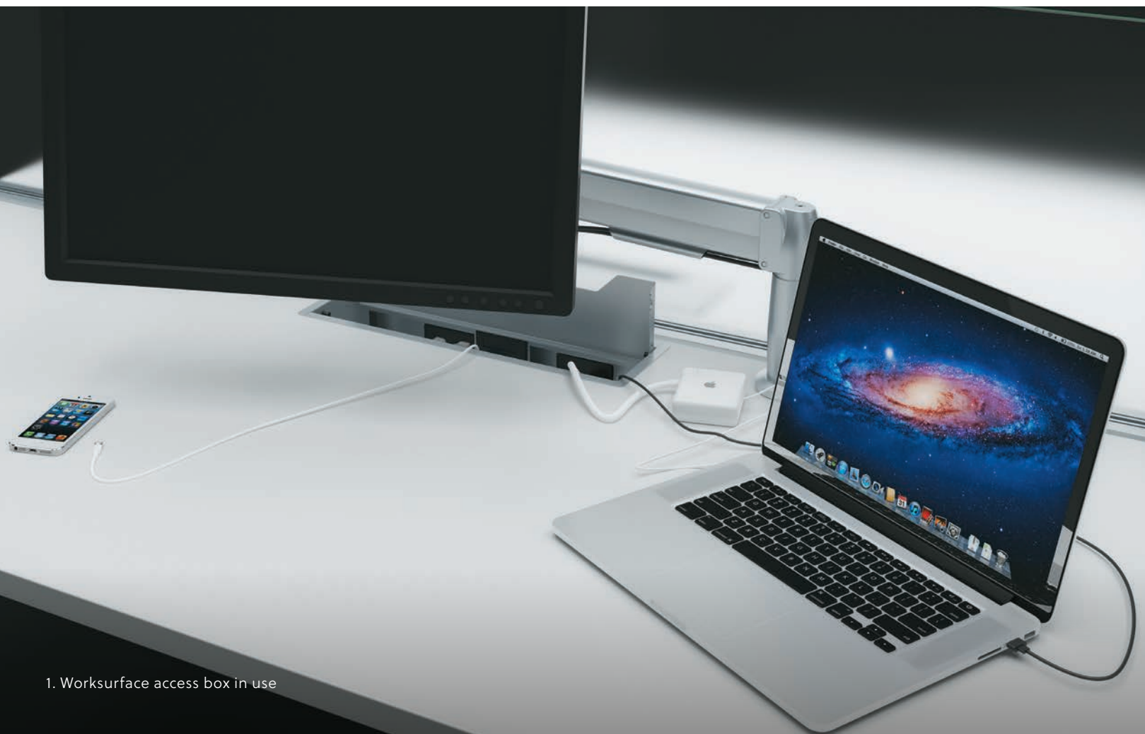
1. Workspace access box in use