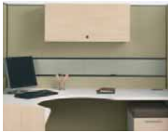
Off-module storage Off-module fasteners make it possible to install storage without horizontal modular restrictions.