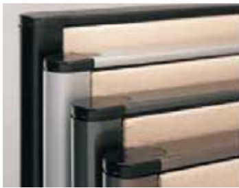
Trim finishes Available in six colours to harmonize with the decor.