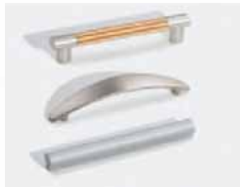
Stylized handles Three types of handles, three styles to complement the decor.