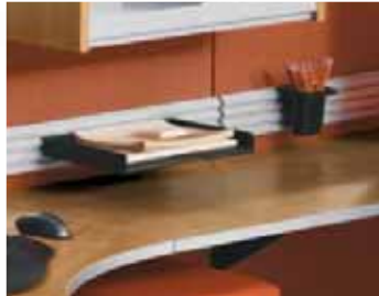
Accessory bars Practical for hanging various accessories (lamps, pencil holders, etc.), keeping the work surface clear.