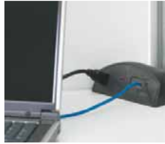
Multiple outlets Easily accessible, they are installed on the work surface.

We have a network set-up. To deal with the competition, we need our technological resources to be quickly accessible, which is why we need fast, easy, and user-friendly access.