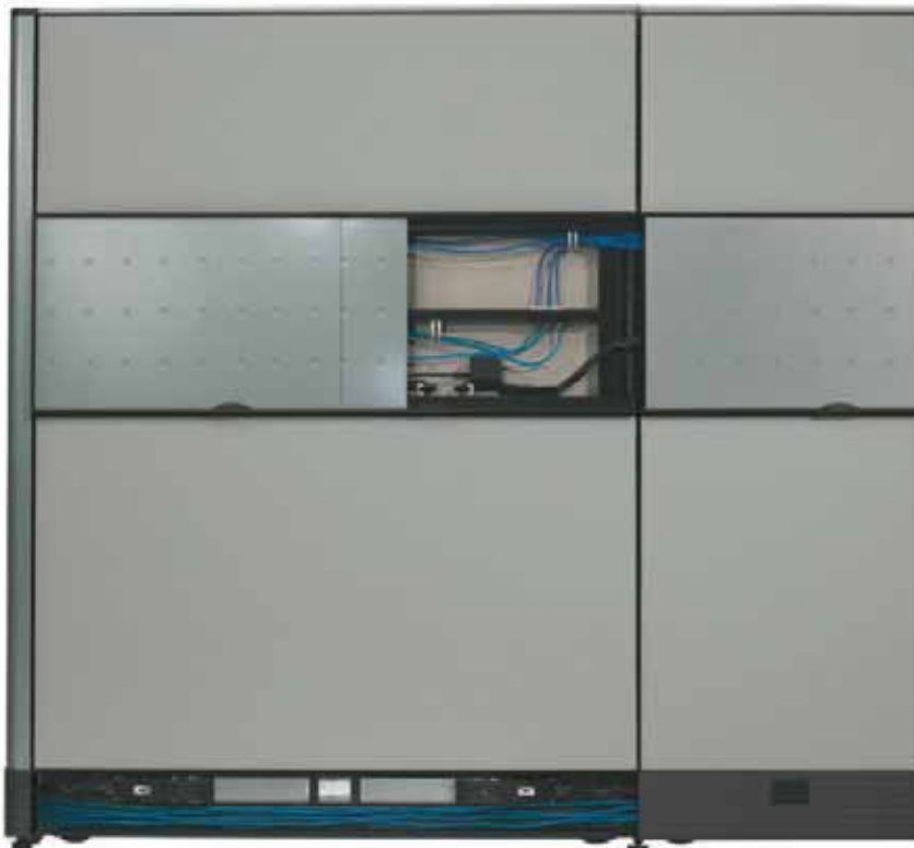
The uni-t system always incorporates electrical wiring and telecommunication cable ducts at the base of its panels. Additional ducts are also available in the stackable media panels. These can be easily accessed from sliding doors at the workstation level.