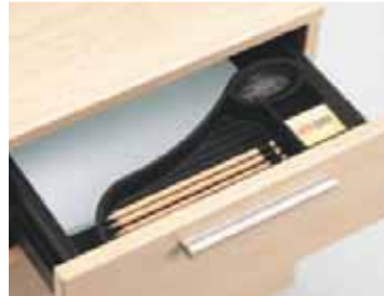
Pencil tray Useful for storing small office accessories, they keep the desktop free of clutter.