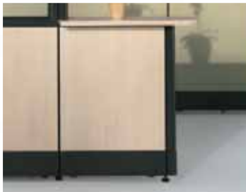
Laminated or fabric panels A selection of coverings lends itself to the creation of harmonious architectural arrangements.