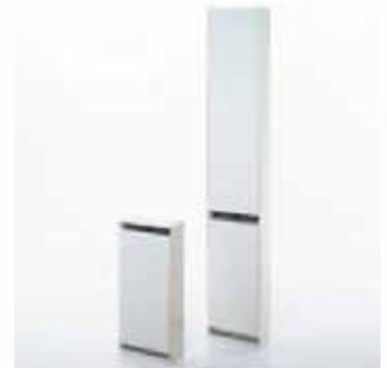
Consolidation towers Designed to centralize electrical and telecommunication connections.