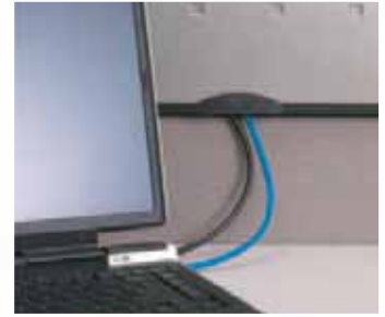
Media wire sleeve Providing discrete access to ducts carrying electrical wires and telecommunication cables.