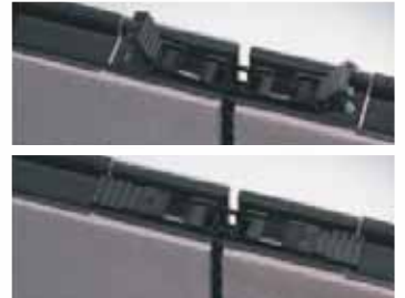
Panel assembly system The patented "Kliplok" system allows for fast, tool-free panel assembly.