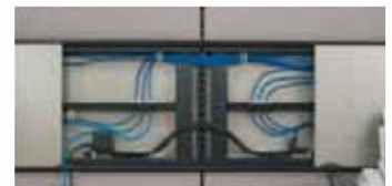
Cable routing Cables laid, rather than fished, to facilitate installation and reconfiguration. The ducts' design also makes it possible to ensure the wide radius required by fibre optics.