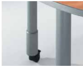
Esthetic finish Aluminum-finish edges and legs complement the units, conferring a touch of elegance.