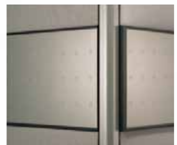
Cable access Stackable media panels are available with a flush decorative tile or covered by sliding doors. This design provides more space for ducts in a panel that is as thin as ever.