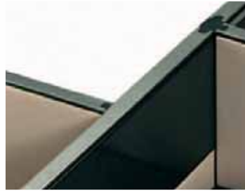
Off-module T connectors These are ideal for stabilizing the end of a row of panels or to create a perpendicular row of off-module panels.