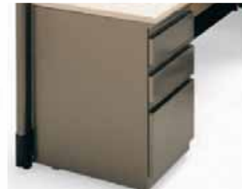
Metal storage units Sturdy and ingenious, the metal storage units are available in a freestanding model capable of supporting the surface, as well as in a mobile model.