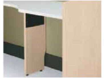
Adjustable middle support A single support can be placed off-module, making it possible to adjust adjacent surfaces to two different heights, as needed.