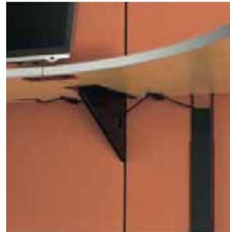
Wiring sleeves, ties and cable ducts To conceal and organize wires and cables.