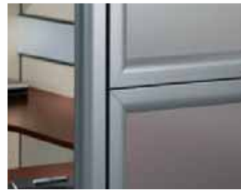
Translucent corrugated, clear or frosted screens These options allow you to play with the ambient light while ensuring the required level of privacy.