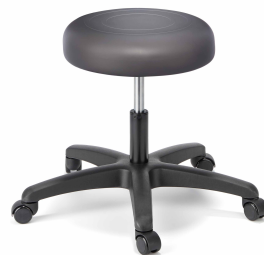
Fusion Round Stool R+