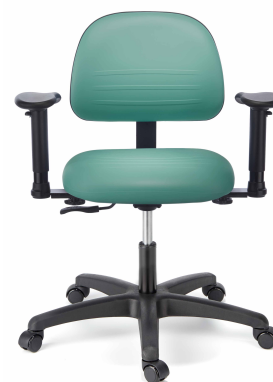
Fusion Fit R+