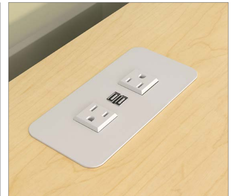
Power, data, and video connections can be brought to the worksurface using pass-through grommets or desk-mounted electrical grommets.