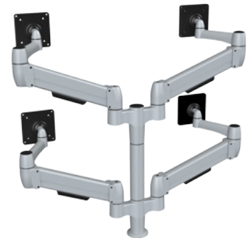
Modula Double Tiered Monitor Arm 64.SA22