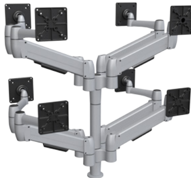
Modula Quad Tiered Monitor Arm 64.SA44