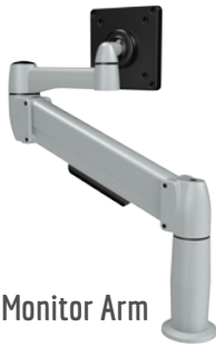
Modula Single Monitor Arm 64.SA01

Modula monitor arms provide more ergonomic usable workspace by supporting flat panel display screens and laptops off the work surface and allow you to quickly and easily move your screen to the most ergonomically appropriate positions. Our patented “Hub & Spoke” system provides modularity for ease of reconfiguration.