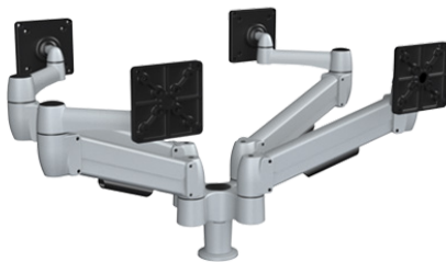
Modula Quad 4 Monitor Arms 64.SA04