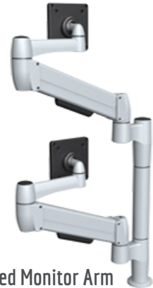
Modula Tiered Monitor Arm 64.SA11