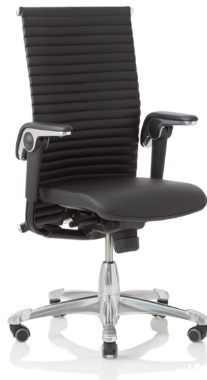
Design: Svein Asbjørnsen/sapDesign@. Patent- and design protected.