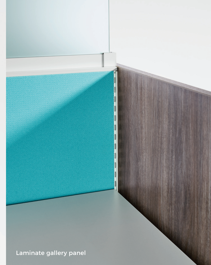
Laminate gallery panel