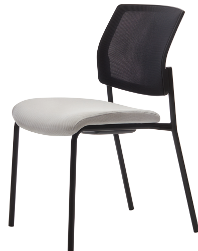
FT31 Quadrille QA02 Cabaret