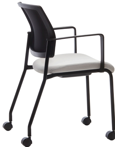
FT32C Quadrille QA02 Cabaret