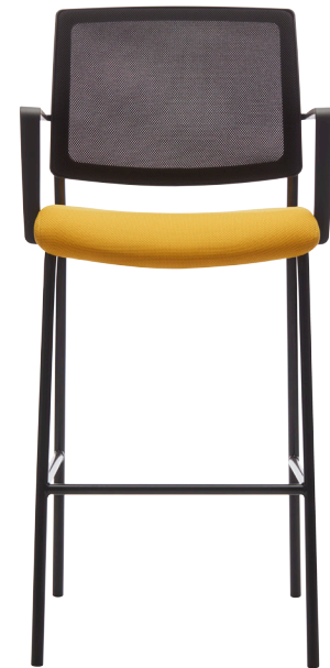
FT32H Quadrille QA07 Zest