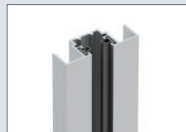
Vertical Adapter to connect to any Volo condition.