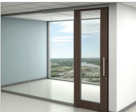
Wood Sliding Full Lite Door with 18" Post Pull