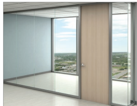
Flush Wood Swing Door with Lever Lock Set