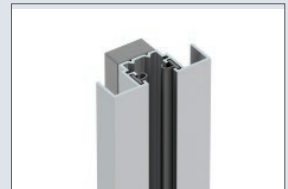
Vertical Adapter with foam tape (when attaching to drywall).