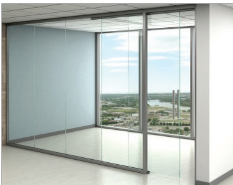
Frameless Glass Sliding Door with 18" Post Pull