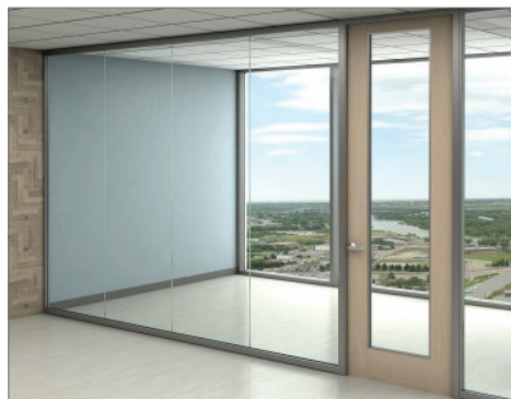
Wood Full Lite Swing Door with Lever Passage Set