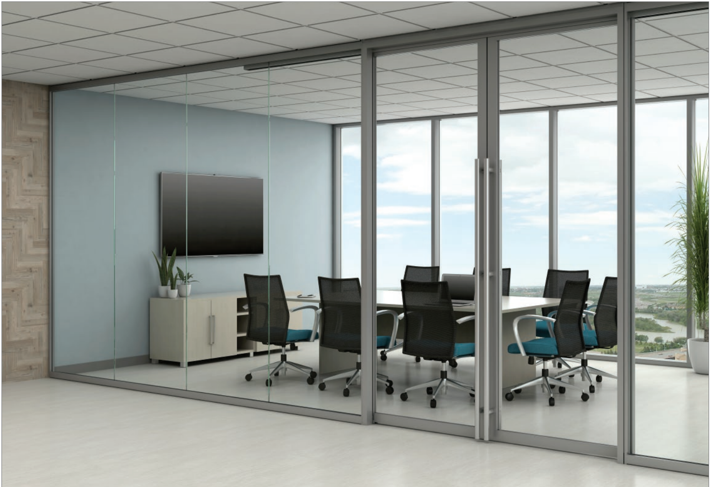
Aluminum Framed Double Sliding Door with 72" Ladder Pull

The new panels join a full Volo array of options that let you create a workspace to meet your needs, vision, schedule — and budget.