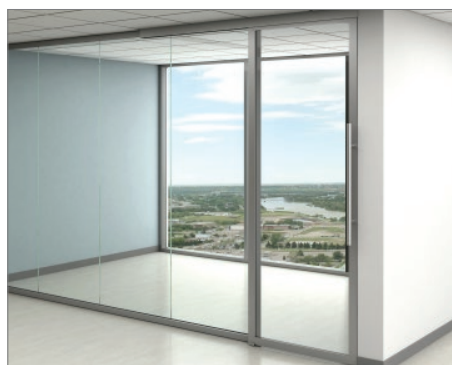
Aluminum Framed Sliding Door with 36" Post Pull