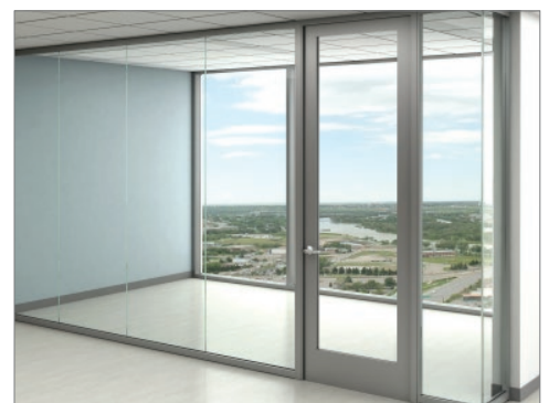
Aluminum Framed Swing Door with Lever Lock Set