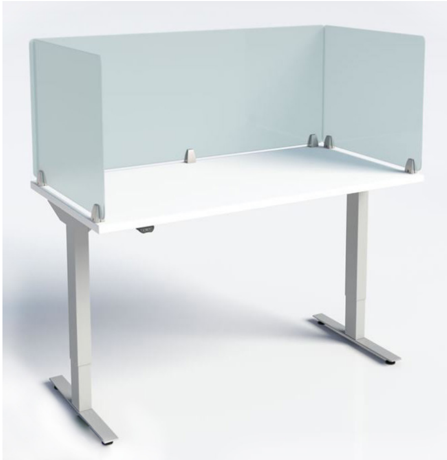
FRAMELESS ABOVE DESK PRIVACY PANELS

Enclave is a system that fits virtually any need for desktop privacy. Enclave Frameless Dividers sit above the desk and come in clear or frosted acrylic, whiteboard laminate and 7 colors of EchoScape, a sustainably friendly acoustic material made primarily from recycled plastic.