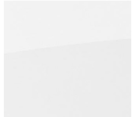
CLEAR ACRYLIC (CLR)