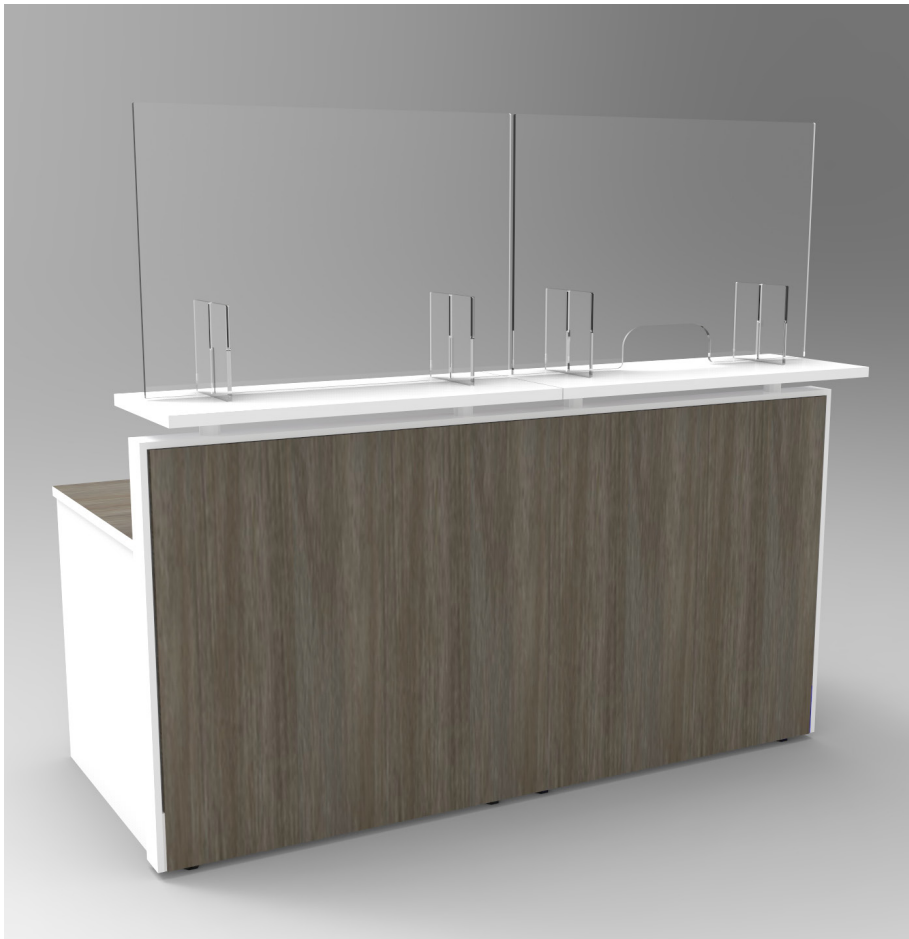
SHOWN AS A RECEPTION DESK VISITOR SHIELD

This versatile visitor shield is designed to be used primarily for reception and counter top transactions. With the freestanding Visitors Shield, you can continue to conduct important client interfacing safely. Standard size 30"-48" W x 24" H.