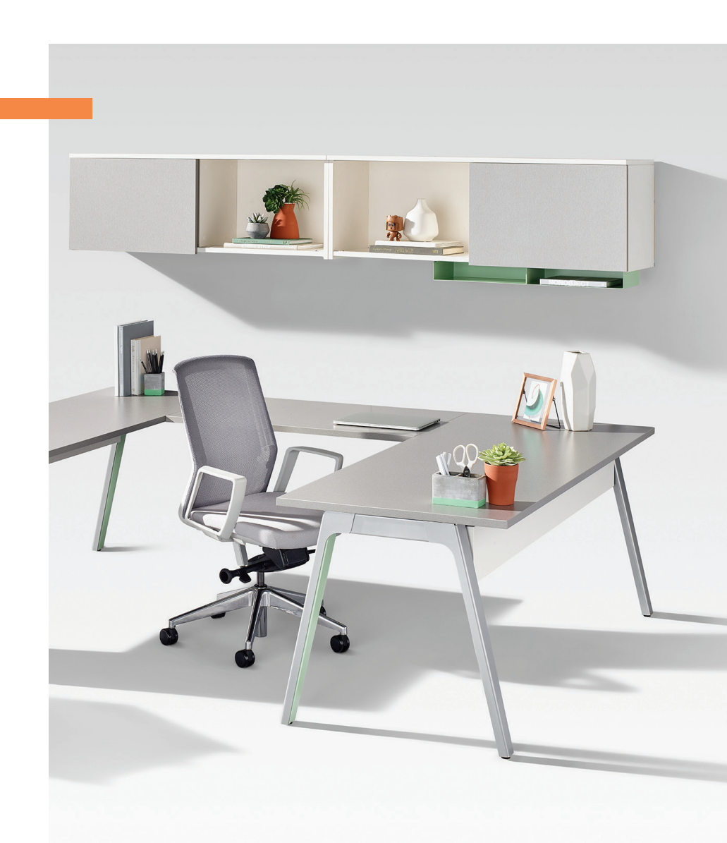
Fig40 is a Toronto based industrial design studio driven to developing relevant, sustainable and award-winning products that inspire collaboration – collaboration between people, and collaboration between design and manufacturing. The outcome is a design that is not only engaging and relevant but also a solution for bringing people together in organic and deliberate ways.

Halifax is a system that reinterprets casegoods: It is flexible, with a clear identity and wide scope of application."